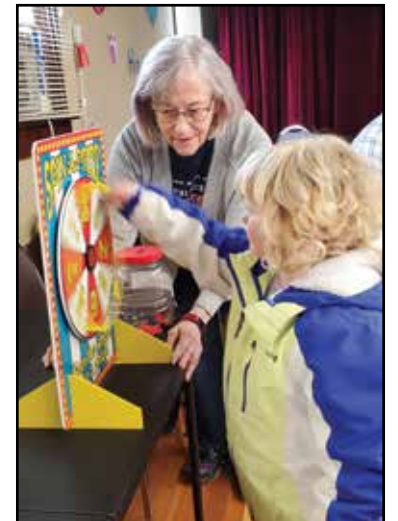
Clarkston Heights Grange recently held their Easter Carnival. Part of the Easter Carnival was their egg and painted rock hunt. A hot dog lunch was also served. The kids and adults alike all had a great time.