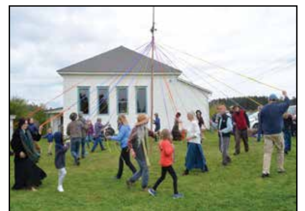
Lopez Island Grange (San Juan County) celebrated May Day with their Annual Maypole Dance.