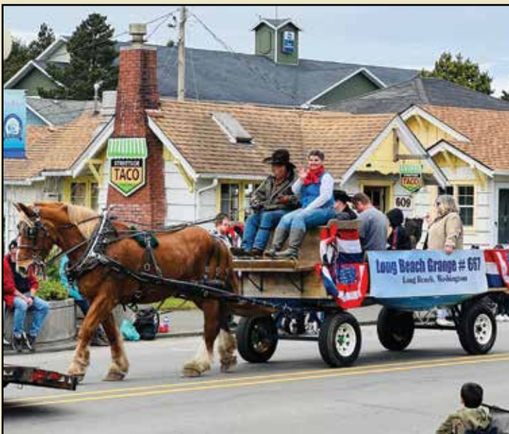
Long Beach Grange (Pacific County) participated in the Loyalty Day Parade in downtown Long Beach on May 1.