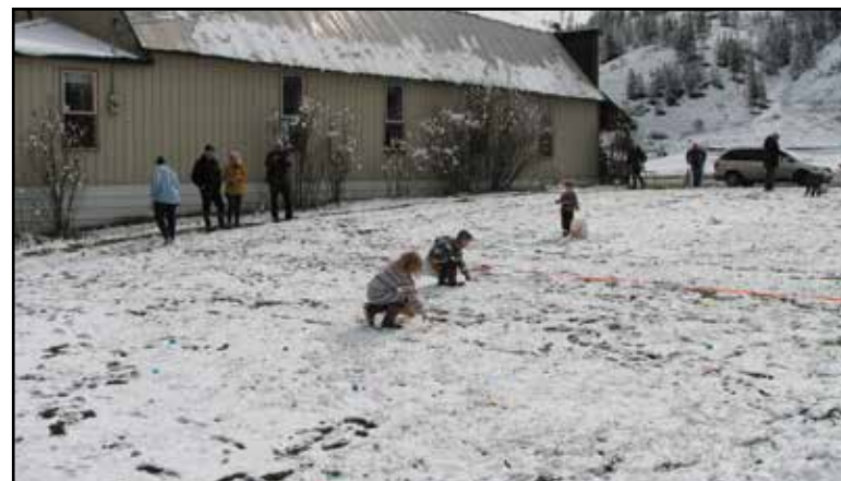
Malo Grange is finally getting active again and what better way than an Easter Egg Hunt? No one expected the two inches of snow we would receive the day before.