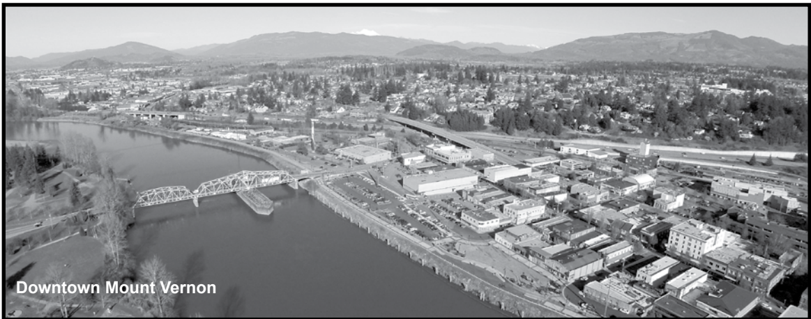
Downtown Mount Vernon

129th Annual Washington State Grange Convention at the Skagit County Fairgrounds, 479 West Taylor Street, Mt. Vernon, WA 98273