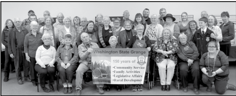
Klickitat County Grange 150th Anniversary Celebration. Seven granges represented: Alder Creek, Centerville, Columbia, Glenwood, Goldendale, Mt View, Trout Lake with historical regalia and a presentation from the local Goldendale FFA organization. What a great turn out Klickitat County Granges!