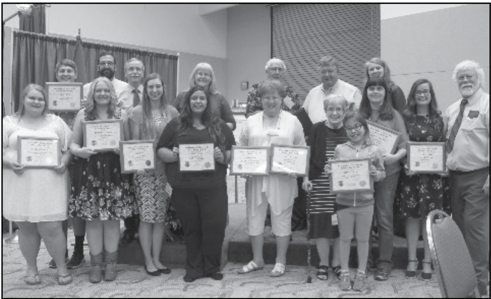
2017 State Grange Scholarship winners were recognized by the trustees of the Washington State Grange Foundation during the Celebration Banquet at the Annual State Grange Convention.

My email is chief_mechanic@hotmail.com. Our goal is to help Granges grow and prosper. If you have ideas to share feel free to contact me.