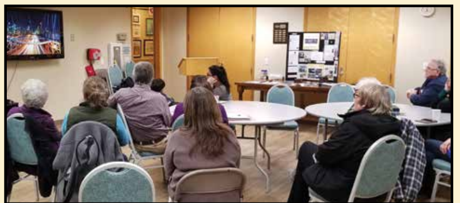
Friday Harbor Grange members and guests are pictured watching two video presentations about the Grange. Friday Harbor Grange highly recommends these two videos for Open House events, which are well done, informative and interesting. One video is 5 minutes, the other 45 seconds. These videos can be found on the National Grange YouTube page.

Hall. The Grange served approximately 187 people for breakfast.