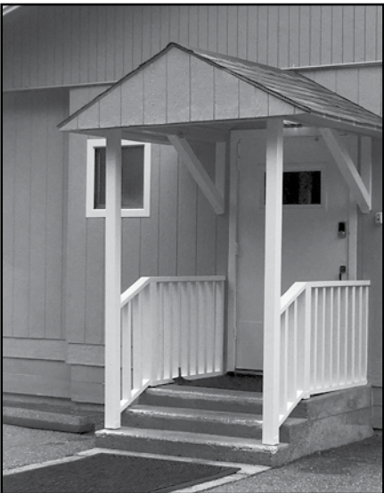
Photos: (Top left) Renovated street signage. (Right) New main hall entrance. (Bottom) Sammamish Valley Grange sports a new exterior coat of paint.