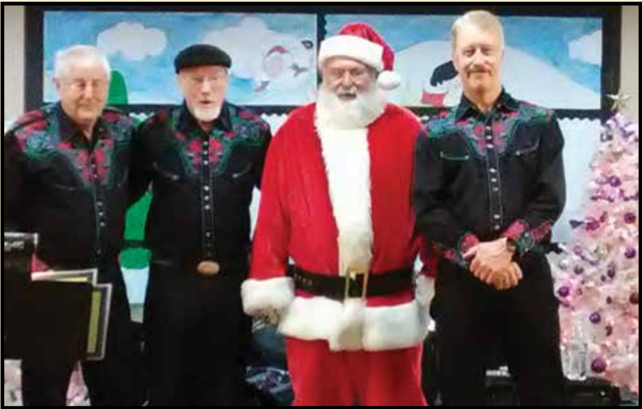
Barberton Grange held a Christmas Dance with music by Steel and Velvet. Thank you Santa for the visit. It was great to see everyone!