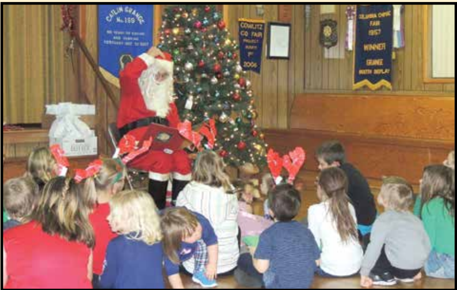
The children, along with the adults and members of Catlin Grange, had a fun time at the Catlin Grange Christmas Party. Santa read the children a Christmas story. The children also had fun with a cake walk, fishing for gifts and trying to break the piñata.