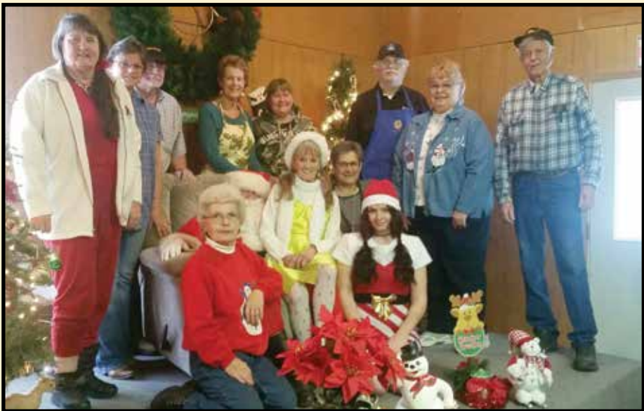
San Poil Grange held their annual Christmas Breakfast with Santa and Country Christmas Bazaar. The funds earned from these make it possible for their annual Senior Scholarships.