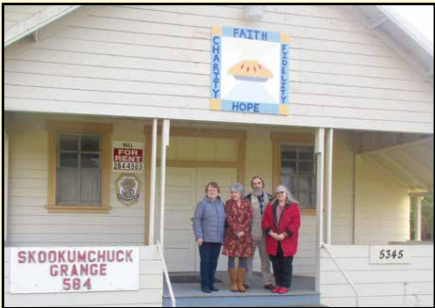
Skookumchuck Grange finally has our Quilt Block up and displayed at our Grange. We decided on the pie design because the ladies of our Grange are famous for baking them. The Skookumchuck Valley and farms provide us with the ingredients needed. We wish to added to the Quilt Trail so others can enjoy our beautiful valley.