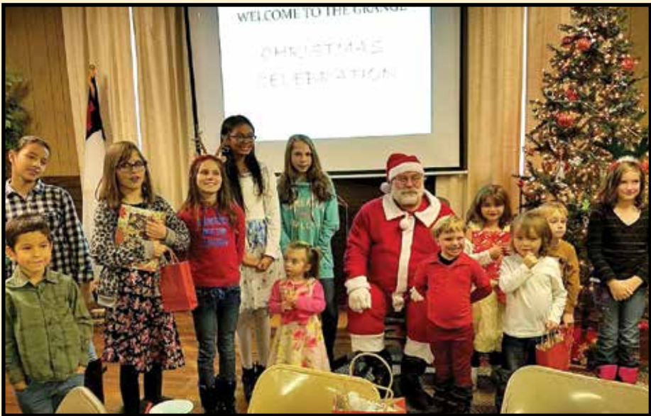
Santa attended the Christmas Celebration at Eagle Cliff Grange, and brought smile to the children's faces.