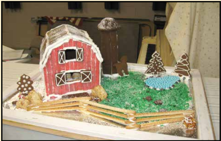
Thurston County Pomona members made Gingerbread structures for the December 7 Christmas meeting and celebration, held at at McLane Grange.