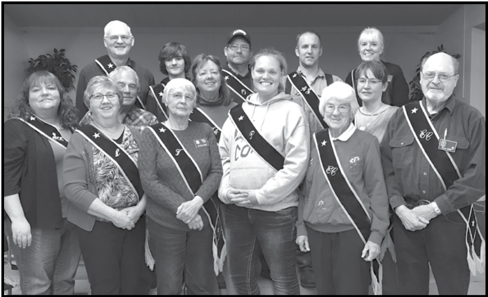
Sequim Prairie Grange 2018 Officers pose for a photo at their December business meeting.

Adna Grange will hold our Potato Bake on Saturday, January 27, 2018 at Adna Grange, from 11:30am-1:30pm. $7.00 includes: baked potato, toppings (chili, butter, sour cream, cheese sauce, chives, bacon, tomatoes, broccoli, shredded cheese, jalapeños, black olives, ranch dressing), plus salad, dessert, and beverage. Adna Grange is located at 123 Dieckman Road, Adna, WA. New Feature: The Washington Old Time Fiddlers Association District 9 will be having a meeting and acoustic music jam at the Adna Grange from 10:00am to 1:00pm in the Main Hall. They are a non-profit organization that is all about learning, playing and sharing old time acoustic music in a family-friendly environment. All instruments are welcome, including vocals, but must be acoustic, no electric instruments or amplification is allowed. The meeting and jam are open to the public and all ages and abilities are welcome from beginner to professional. New members are welcome and you do