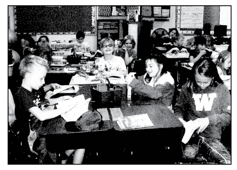
Rose Valley Grange recently presented dictionaries to Rose Valley third graders, who quickly began searching for all the interesting information that is in the back of this "Student's Dictionary" as part of the Words for Thirds program.

Green Bluff Grange has been having some exciting times at their newly renovated Grange Hall. They say "If you build it they will come" and we had lots of folks come to see our Revived, Refreshed, and Rejuvenated Green Bluff Grange at our September 30 breakfast. And they were still coming to see at the three Sunday breakfasts we had in October. During those three