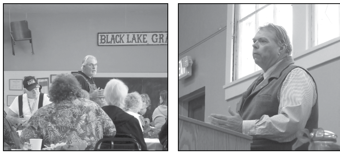
Thurston County Pomona hosted their Farm City Dinner at Black Lake Grange on October 14, 2018.