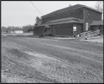
The parking area after grading and repairs.