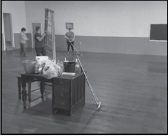
Grange members gave the meeting room floor a good mopping.