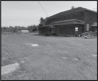
The parking area before work.

Three additional members joined the Grange at their February 21 meeting. Plans were made for work party to repair and clean the hall. The work party was held on March 24 with a large group in attendance.