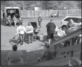
The Grange provided lunch for all those who joined them in their work party.