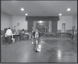
A group of Grangers cleaning the main meeting room