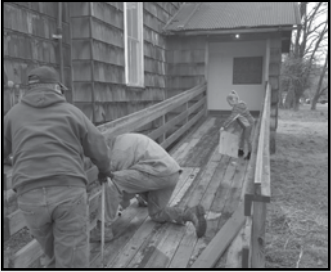
Grange members and junior Grangers working to repair the ramp.