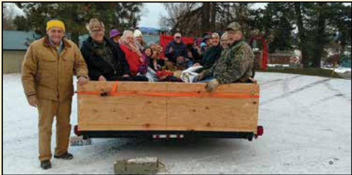
Green Bluff Grange members enjoying an Olde Fashioned Hayride around the bluff.