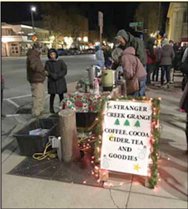
Stranger Creek Grange served hot beverages and goodies to help kick off the holidays in Colville. It was much appreciated on the cold evening of the tree lighting ceremony and the next day during the carriage rides, provided by Grange member Jeff Upton and family and their horse "Derby".