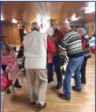
Members enjoy one of the two WA State Grange Christmas Events.

Thank you to South Union and Moses Lake Granges for hosting the events. Plans are to hold the 2020 events earlier in December.