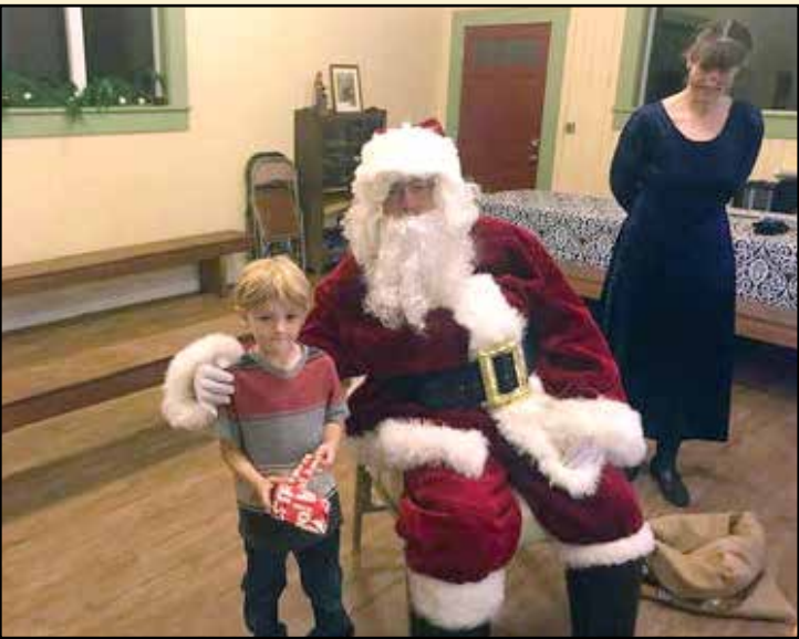
Santa Claus delivered early presents at last week's annual Christmas Party at the Grays River Grange.