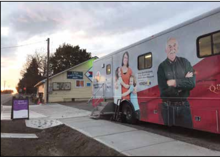
Five Mile Prairie Grange recently teamed up with the Inland Northwest Blood Center for a successful blood drive.