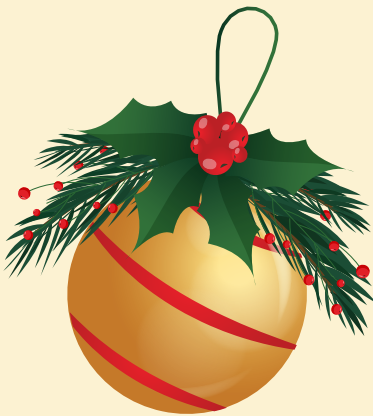
On December 19th, Barberton Grange hosted our annual Christmas Dance with Steel and Velvet, capped off with a visit from the man himself.