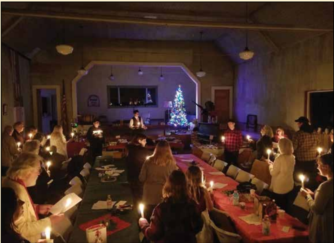
Picture from the Grays River Grange #124 Christmas Party. We end each Christmas Party with a candle light Silent Night.