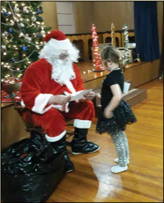
Matlock Grange hosted a successful Christmas celebration. Attendance of 50 people. 15 kids for Santa. Ham and Turkey dinner with lots of cookies and cakes. Fun was had by all parties.