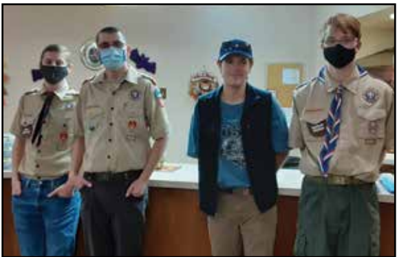
Barberton Grange is back holding our monthly breakfast. Special thanks to our new help, BSA Troop 333, who have also joined the Barberton Grange family as our newest steady renters.