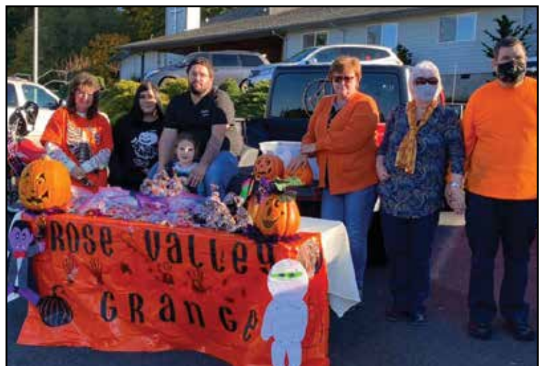
Rose Valley Grange at the Trunk or Treat event at Rose Valley Church.