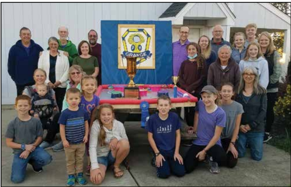
Five Mile Prairie Grange at the Spokane Interstate Fair - First place Grange fair booth and winner of the Ellsworth C. French memorial trophy for General Attractiveness!