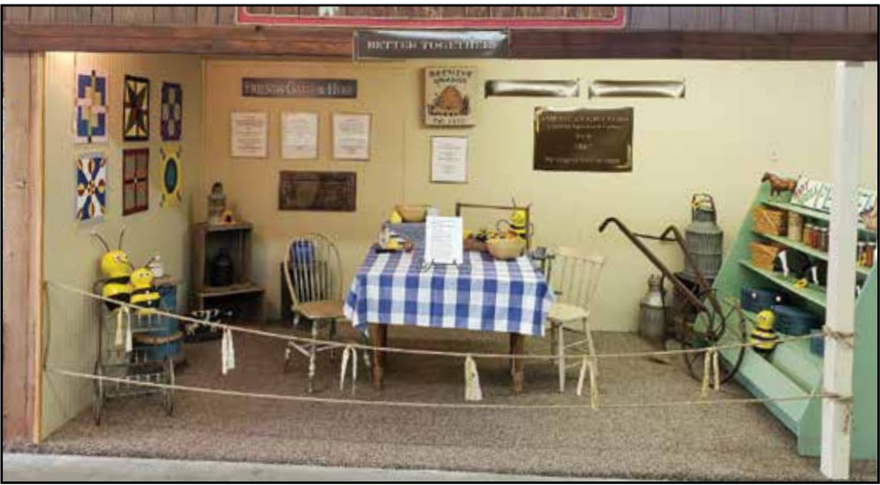
This last August, a group of BeeHive Grange members set up an exhibit at Waterville Fair, also known as the NCW Fair. It was so much fun to get together and bee creative together as well.