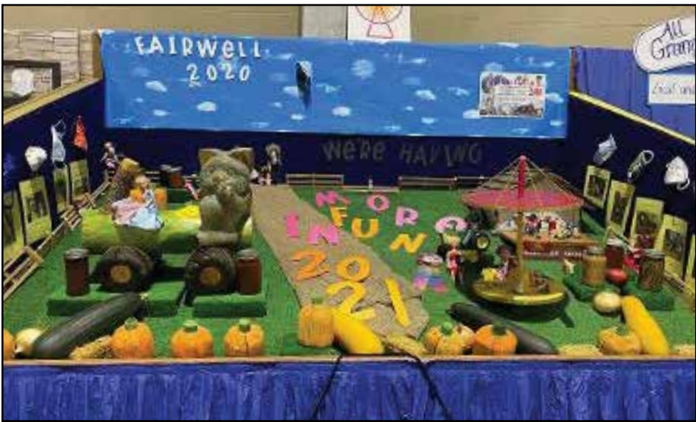
Green Bluff Grange Fair Booth - even though we did not win first place we received the People's Choice award!