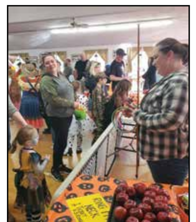
Pumpkin carvers and games of all types entertained the crowds at the Fall Festival at Sequim Prairie Grange.