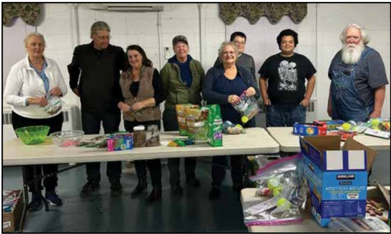
Lower Naches Grange #296 prepared 70 bags of dog & cat treats to be given to folks with pets who receive Meals on Wheels.