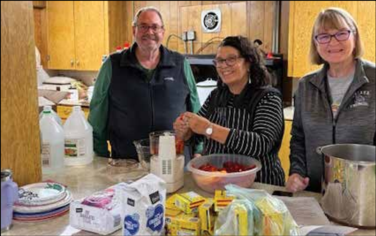
On November 5, Buena Grange hosted an event making red pepper jelly. We produced 96 jars of jelly!