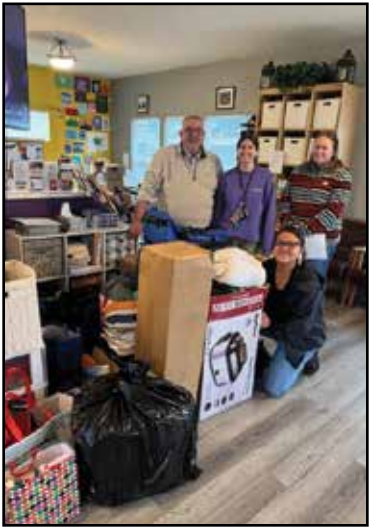
Yakima Valley Pomona Grange #11 members enjoyed a wreath making class on Sunday, December 1st at the Terrace Heights Grange hall, along with a dessert social. They later played Bingo with players bringing basic needs items for our local youth shelter, Rod's House. A generous check was also included with their donation.