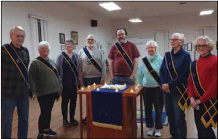
(Left) Photo from our February social meeting when we participated in an activity called "Drums Alive". (Right) Our recent "lecturer's program" was the candle lighting ceremony. This was on March 4, 2025.