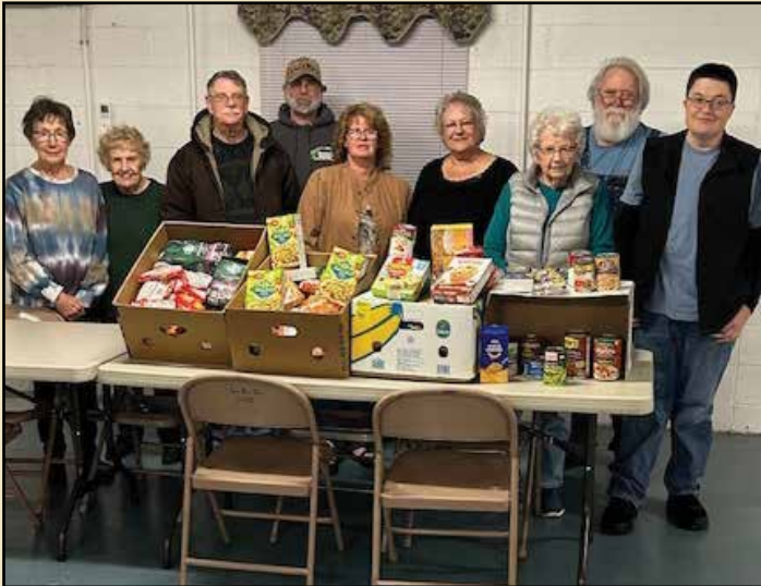
Lower Naches Grange recently collected food for a local food bank. This time of year it is greatly needed.