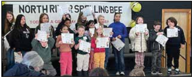
North River Grange held a spelling bee for the North River Elementary grades 1st through 6th. Pictured are the 1st, 2nd and 3rd place winners.